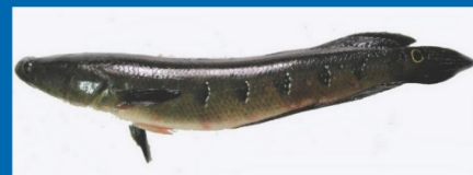
➤ Striped Murrel, ( Channa striatus )