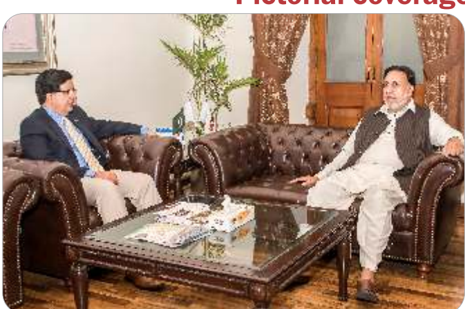
Vice-Chancellor in a meeting with Provincial Minister Mian Mehmoodur Rashid.