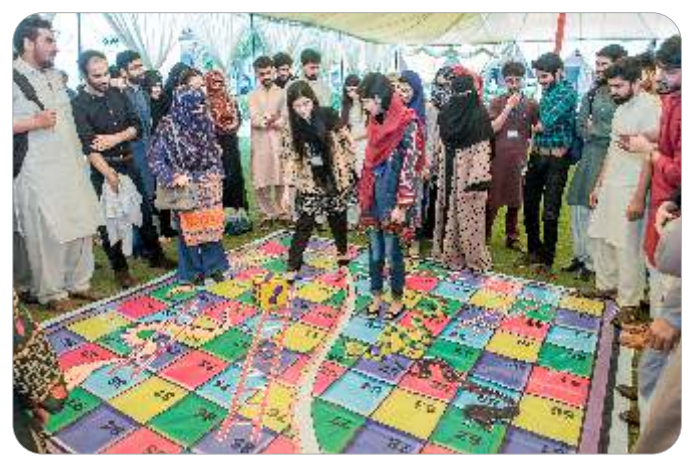
Students take part in a competition at UVAS Olympiad (The Artistry Hub).