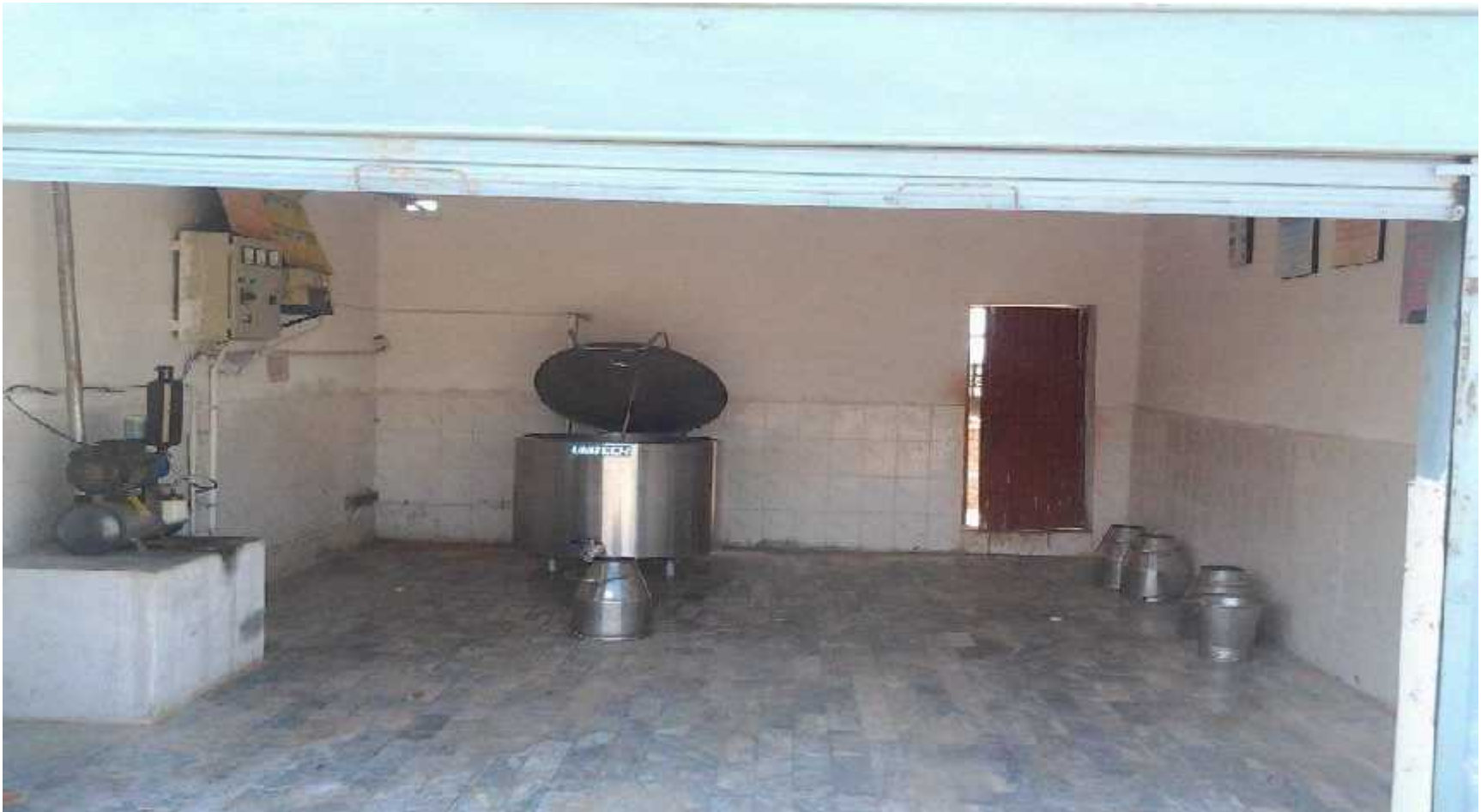
Chilling set-up at a local farm at GOJRA