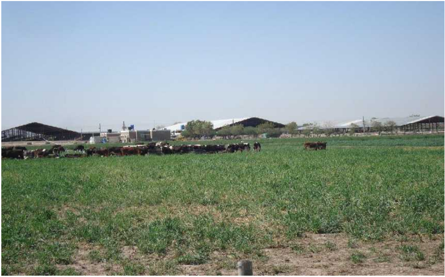
A local commercial farm (Punjab)