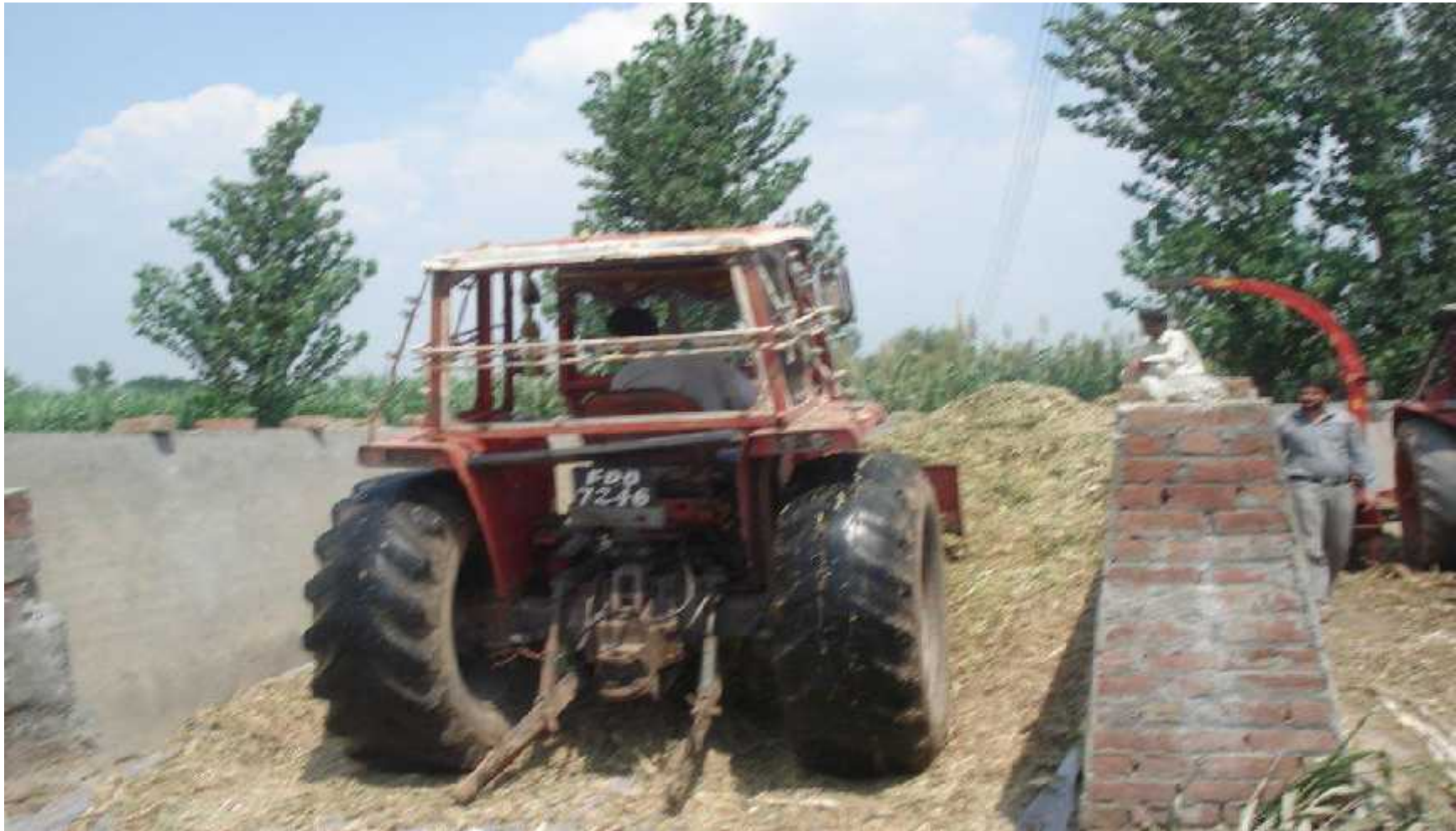
* Silage Production at a local farm in Punjab