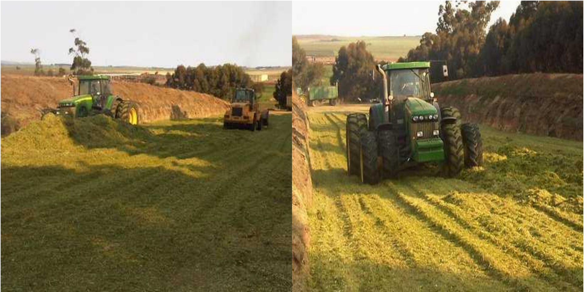
Silage production at a large Farm