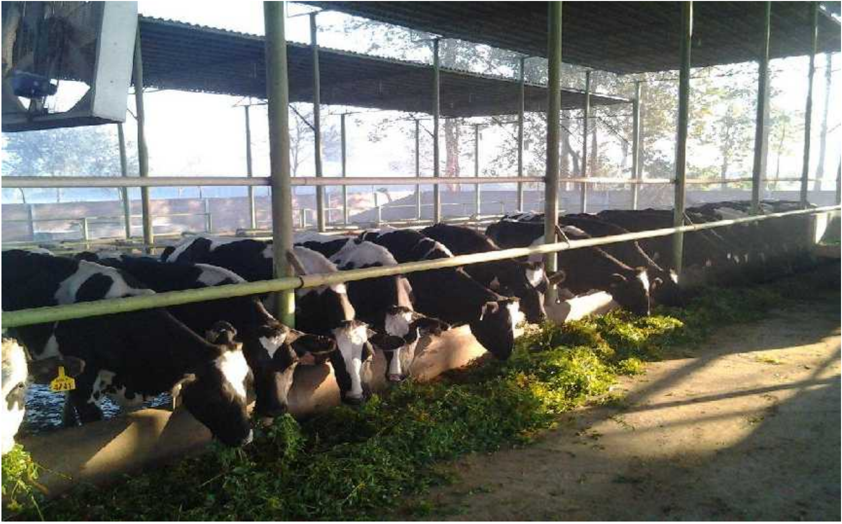
Feeding Table at a local farm (Punjab)